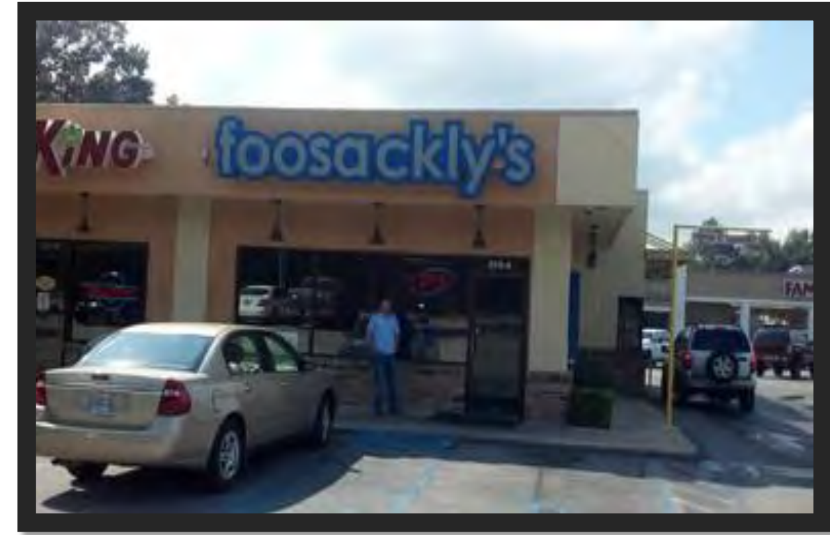
FOOSACKLY'S – FOLEY, ALABAMA

Market research indicated a demand for retail food service and for-rent residential units in Birmingham's Southside Lakeview Entertainment District. Through a partnership with The City of Birmingham, the company's first 29Seven concept was developed. The mixed-use project, consisting of 54 Class A residential units above 20,000 square feet of food service retail space, was completed in Fall 2012 with 100% lease up of both the residential and retail space.