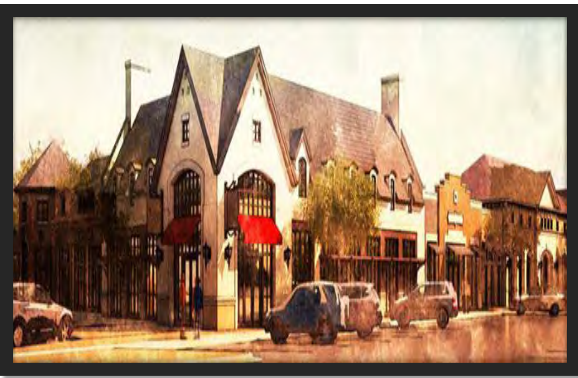
LANE PARKE – MOUNTAIN BROOK, ALABAMA

Retail recruitment, market analysis and leasing services were provided to the owner of a 1950's-era shopping center and apartment complex, which is being redeveloped into a high-end, mixed-use development. Retail Strategies completed the research and made a presentation to the city to rezone the 27 acre site to PUD. Research uncovered an opportunity to recruit luxury retail tenants, most of which are locating in Alabama for the first time. Lane Parke will feature over 160,000 square of luxury retail, 25,000 square feet of office space, a 100 room boutique inn, and 320 luxury residential units.